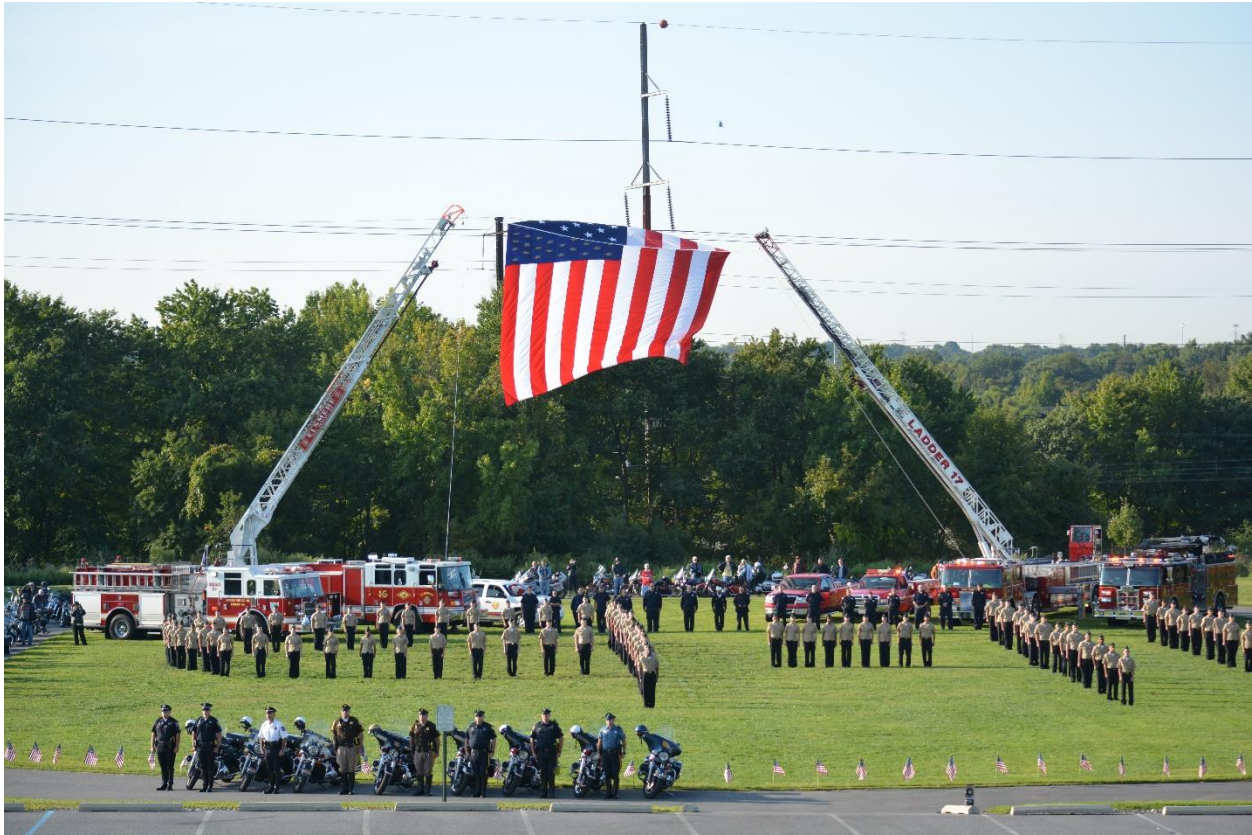
(DMA's 9/11 Tribute September 2017)